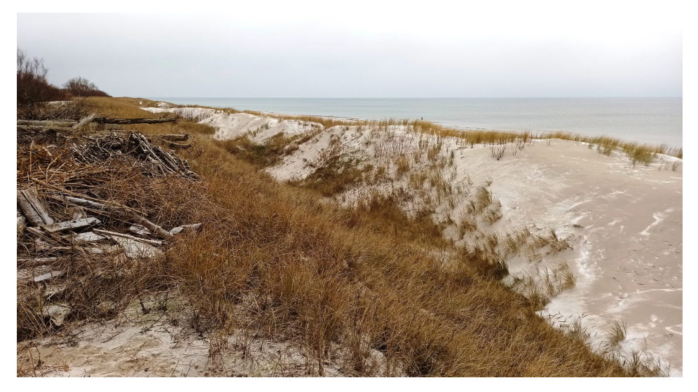
Fig. 2. Shallow deflation basin.

Trail planning . At the next stage, the trail is planned taking into account the location of the target objects, as well as environmental requirements. If it is possible to use different modes of transportation, the trails for each of them are specified.