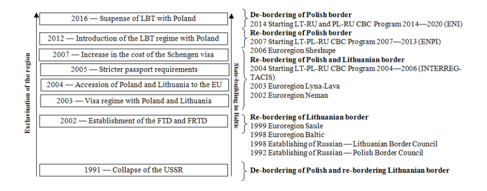
Fig. 1. Exclavization and the development of cross-border cooperation in the Kaliningrad region

Negative effects of the exclavity were not observed immediately after the demise of the USSR; they developed gradually. It is possible to say that a gradual process of 'exclavization' evolving from a legal to a real exclavity of the region [7] (Fig. 1).